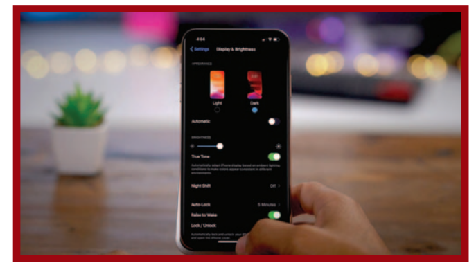
CONTINUED ON PAGE 20

iOS and iPad OS now come with the option of Dark Mode. The menu system traditionally had a white background with black text. This could sometimes affect people with glare sensitivity. Dark Mode allows us to change this to White Text on a Black background. Dark Mode now carries over to a lot of native apps like Mail and Safari and is expected to be supported by many Third Party Apps.